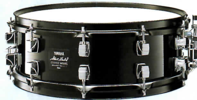
◀ MSD14SG Size : 14"x5" Shell : All Maple 7-ply 7mm