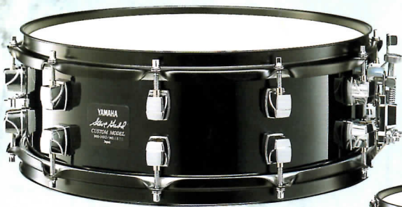
▲ BSD14SG Size : 14"x5" Shell : All Birch 6-ply 6mm