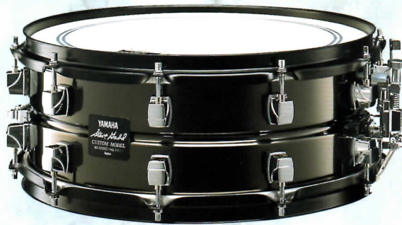
▲ SD255SG Size : 14"x5 1/2" Shell : Steel 1.2mm

YAMAHA Steve Gadd CUSTOM MODEL BSD-14SG / NO. 0000 Japan