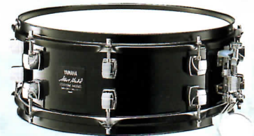
MSD13SG ▶ Size : 13"x5" Shell : All Maple 7-ply 7mm