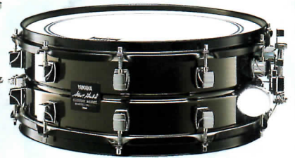
▲ SD455SG Size : 14"x5 1/2" Shell : Brass 1.2mm