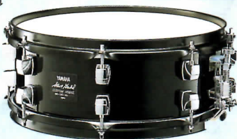
BSD13SG ▶ Size : 13"x5" Shell : All Birch 6-ply 6mm