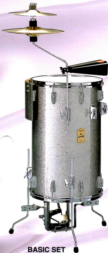
BASIC SET (*CD15CJ)