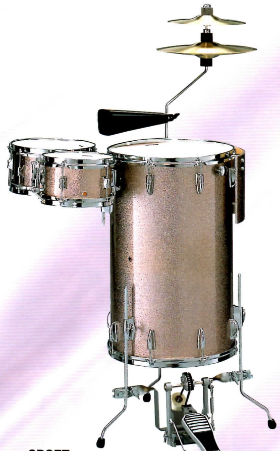
CDSET (*CD15CJ, SD08CJ and TT10CJ)