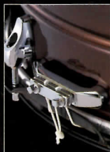
Butt Side (DC Type)

Strainers utilized on the Mike Bordin signature snare consist of an H type strainer on the release side and a DC type on the butt side. Strainers are designed to minimize surface contact between the shell and the strainer while delivering a natural sound from the shell.